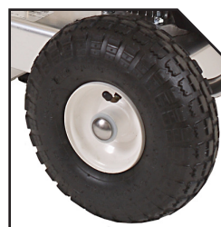
10-inch pneumatic tubed tires with solid steel axle