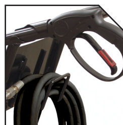
Hose wrap and quick release gun/wand holder